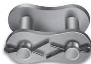
코타핀형 Cotter Pin Type