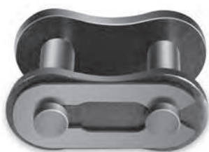
클립핀형 Clip Pin Type